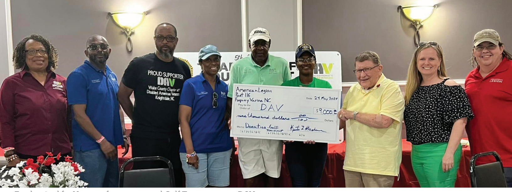
Funds raised for Veterans from our annual Golf Tournament to: DAV